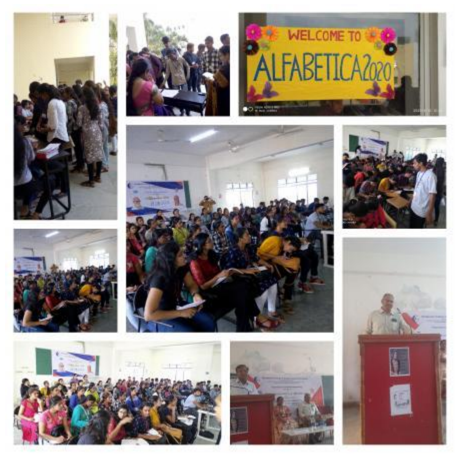
Centre for Soft Skills, in collaboration with The Art of Living Foundation-YES (Youth Empowerment and Skills) has conducted a Three Day workshop from 6<sup>th</sup> and 8<sup>th</sup> March, 2020 (Friday to Sunday) from 9.00 a.m to 4.00 p.m. Nearly 250 students of all branches of Engineering participated in the training. Students were given several tips to reduce and combat stress in various situations.