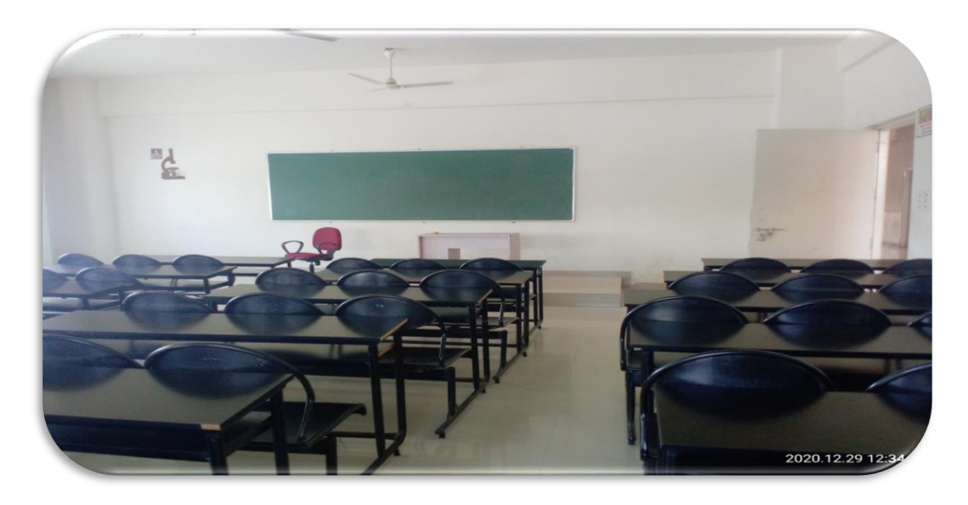
PHARMD III YEAR