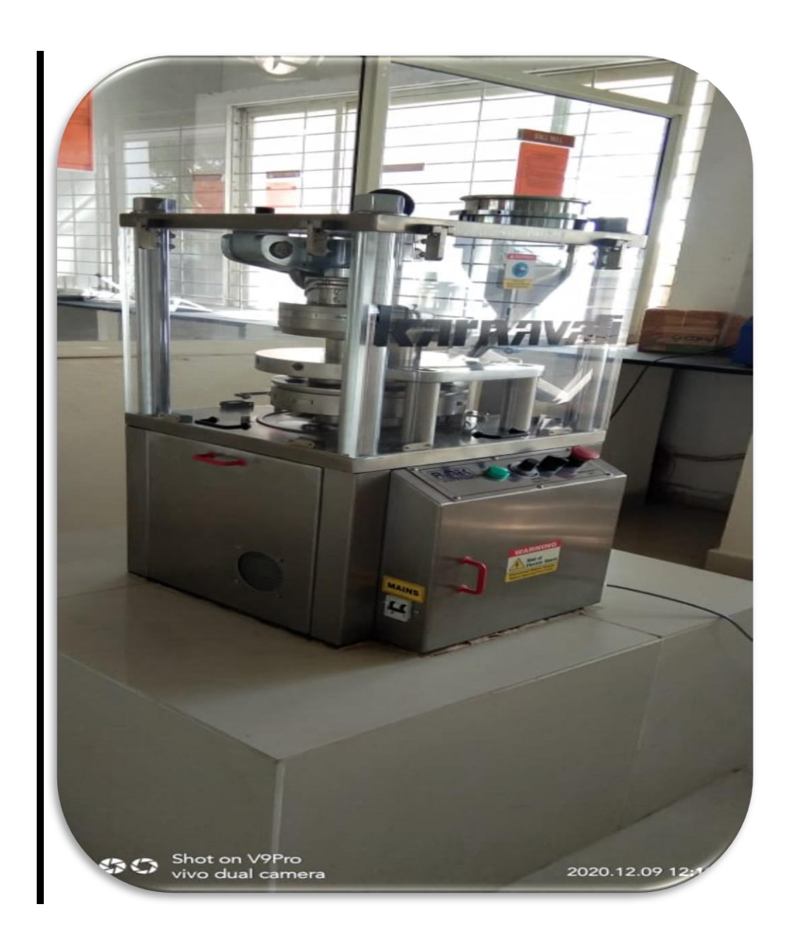
TABLE PUNCHING MACHINE

Cheeryal (V), Keesara (M), Medchal-Malkajgiri Dist., Telangana State-501301