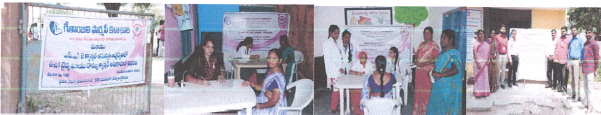
Physicians and our college Pharm D students speaking to village patients.

Total 70 female patients were screened at the camp, with the help of mammogram and other lab designations out of which 05 patients were detected with diagnosis of breast cancer and further they were referred to MNJ hospital for treatment.