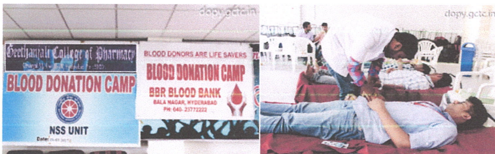
Blood donation at Geethanjali college of pharmacy

Geethanjali College of Pharmacy -NSS Units conducted Blood Donation Camp in collaboration with BBR Blood Bank, Balanagar, Hyderabad. The programme has been scheduled at 10:30 AM at Geethanjali college of Pharmacy seminar hall block no-I. Many of the students came forward to donate the blood and faculty also donated the blood. The event was a grand success.