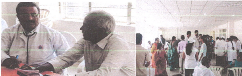
Physician and Pharm D IV year students screening patients.

The camp has been conducted in association with Apollo Hospital Jubilee Hills, and Canara Bank Abid's, Hyderabad on 20/01/2018 at Geethanjali of Engineering and Technology seminar hall I from 10:00 AM-04:30PM. There were 5 Physicians came from Apollo hospital total 150 patients were screened at the camp with different kind of health issues they were referred to Apollo Hospital Jubilee Hills for further diagnosis.