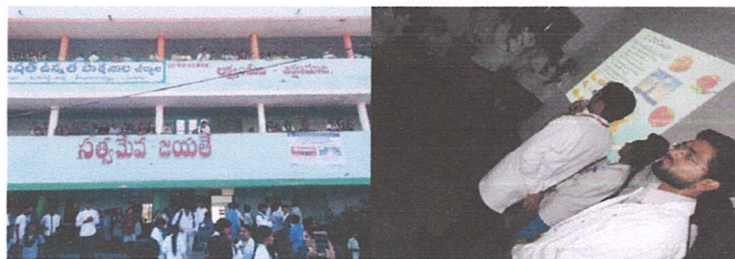
Students' presentation to students of Zilla Parishad School.

Geethanjali College of Pharmacy -NSS Units conducted "Child Care Nutrition and Hygiene Awareness Camp" at Zilla Parishad School, Cheeryal village. The event is based on providing better knowledge to school children about their nutritional food habits and hygienic conditions which can help prevent many diseases like malaria, diarrhea and importance of vaccination (polio vaccine, T.T, Influenza). Our college Pharm D students gave presentation and educated the school students. The event was grand success.