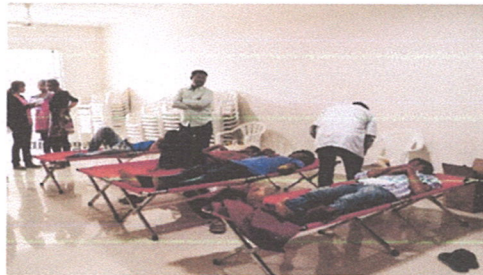
Students donating blood.

Geethanjali College of Pharmacy -NSS Units conducted " Blood Donation Camp " at Geethanjali College of Pharmacy seminar hall block no I in collaboration with Lions Club of Jubilee Hills. Students and faculty came forward for donating blood. The programme was grand success.