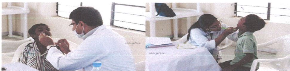
Dentists giving treatment to school students.

Geethanjali College of Pharmacy -NSS Units conducted "Dental Camp" at Geethanjali College of Pharmacy seminar hall block no I in collaboration with KJS Dental Hospital. The event is based testing the students of govt school Keesara. Doctor from KJS Dental Hospital treated more than 30 students. The event was grand success.