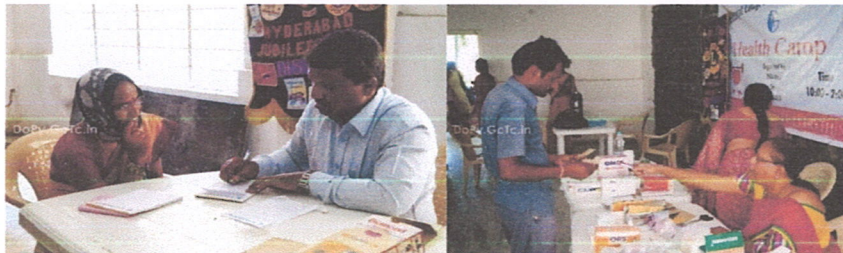
Consultation of physicians and distribution of medicines free of cost

Geethanjali College of Pharmacy -NSS Units conducted "Health Camp" at Geethanjali College of Pharmacy seminar hall block no I in collaboration with Govt Hospital Keesara. The main aim of the event is to give treatment for free of cost to the village people. Large number of village people gathered and the physicians also treated more than 50 patients and medicines were also distributed free of cost. The programme was grand success.