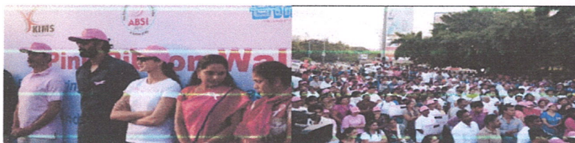
Pink ribbon campaign at KBR park.

Geethanjali College of Pharmacy and Geethanjali college of Engineering and Technology -NSS Units conducted " Pink Ribbon Campaign " in collaboration with "KIMS Hospital". The programme has been scheduled at 09:00 AM at KBR Park, Hyderabad. All the students actively participated in the campaign. The chief guest for the event is D. Rana (Film Actor) and Kalvakuntla Kavitha (Telangana party leader) participated in the campaign. The event was a grand success.