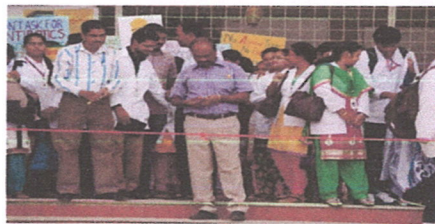
Inauguration of rally by principal sir and rally with placard presentation.